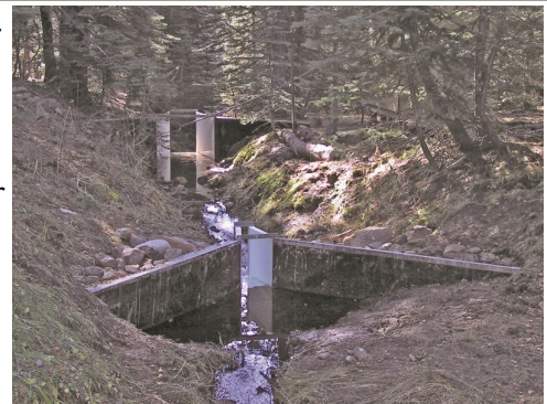
Figure 1—KREW's double flume system. The large flume (background) accurately captures high flows, and the small flume is successful at measuring lower base flows.

Streamflow is the amount of water within the stream channel leaving a watershed. It is expressed as a rate of flow such as: cubic feet per second (cfs) or gallons per minute (gpm). The daily average of streamflow varies during the year ranging from 90-540 gpm. However, during periods of spring snowmelt, average daily flows range from 350-980 gpm. A single rainstorm on December 19, 2010, produced peak flows of 16,500 gpm on some of the lower elevation watersheds. Due to the high variability in streamflow, KREW uses a double flume system to accurately measure flows (fig. 1). A flume is a uniform fiberglass channel placed in the stream. Automated instruments at 15-minute intervals continuously measure water height in each flume. The streamflow can be calculated from the water height of the stream and the cross-sectional area of each flume. This high frequency of data collection allows for an accurate representation of rapid changes in flow that occur during storm events; accurate streamflow is a key factor in determining stream pollution contaminant and sediment loads. In addition, monitoring the change in streamflow before and after watershed treatments (i.e. tree thinning and understory prescribed burns) is critical for understanding the effects of management activities on downstream systems. KREW data are also useful for computer modeling to better understand and predict future streamflow with different vegetation, climate, or air pollution stress.